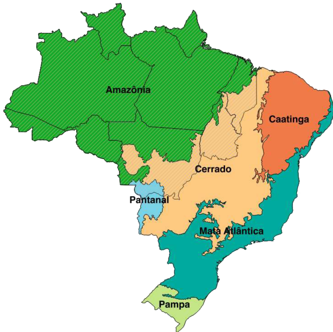
Fig. 4. Brazilian biomes and the Legal Amazon (hatched area).

interest in basic scientific infrastructure was at odds with both the nationalist and applied ambitions of development projects, which led to its demise. The Brazilian government made a second and successful attempt to establish an international scientific program for the Amazon, this time with the Food and Agriculture Organization (FAO) of the United Nations. In contrast to the earlier institute, the FAO “Mission to the Amazon Valley” was placed directly under SPVEA management and funding and thus had a direct link to the country’s development agenda.